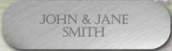
(actual font and plaque size)

Each plaque will be engraved in UPPER CASE and can contain a maximum of 2 lines and 18 characters/spaces. If you are naming more than one seat, please enclose additional text on a separate sheet of paper.